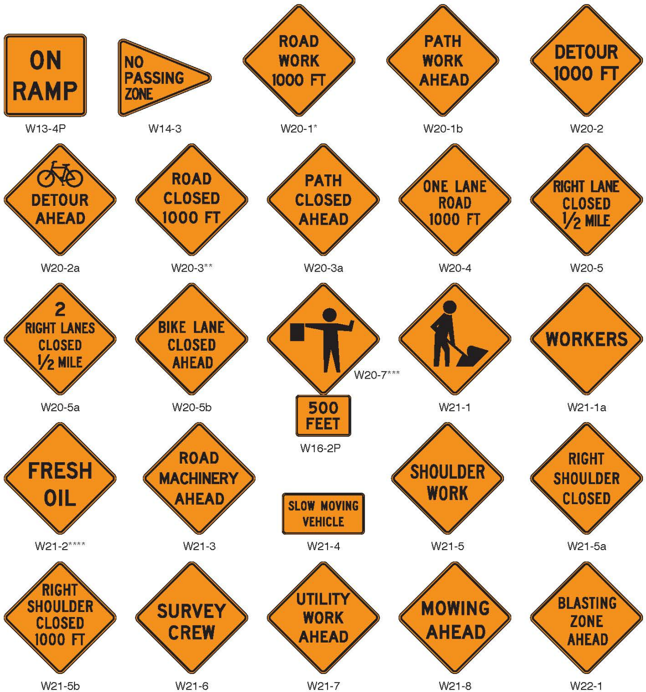
Figure 6H-1. Warning Signs and Plaques in Temporary Traffic Control Zones (Sheet 3 of 4)

Note: See Chapter 2C for information on the application of these signs.