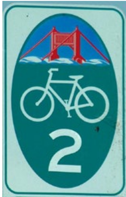
San Francisco, California