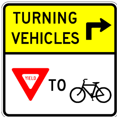
180 181 R10-15ab 182 30" x 30"

177 04 Use of R10-15b and R10-15c signs at signalized intersections is described in Section 2B.53. 178 The following two new signs are added to Figures 2B-27 and 9B-2]: [approved 179 June 2014