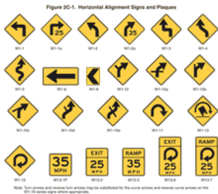
Figure 2C-1 Horizontal Alignment Signs and Plaques

01 A variety of horizontal alignment warning signs (see Figure 2C-1 ), pavement markings (see Chapter 3B), and delineation (see Chapter 3F) can be used to advise motorists of a change in the roadway alignment. Uniform application of these traffic control devices with respect to the amount of change in the roadway alignment conveys a consistent message establishing driver expectancy and promoting effective roadway operations. The design and application of horizontal alignment warning signs to meet those requirements the needs of motorists are addressed in Sections 2C.06 through 2C.15.