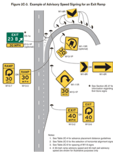
Figure 2C-3 Example of Advisory Speed Signing for an Exit Ramp (deleted)

556 08 06 Figure 2C-3 shows an example of advisory speed signing for an exit ramp. NOTE: 557 This figure was revised and approved by Council on 6-30-17 (16B.RW.04)