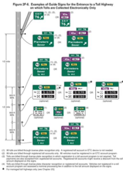
Figure 2F-6 Examples of Guide Signs for the Entrance to a Toll Highway on which Tolls are Collected Electronically Only