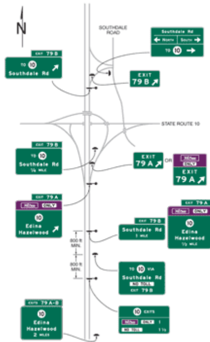
Figure 2F-7. Examples of Guide Signs for Alternative Toll and Non-Toll Ramp Connections to a Non-Toll Highway