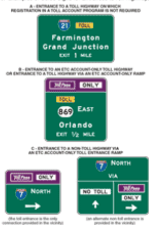
Figure 2F-5. Examples of Guide Signs for Entrances to Toll Highways or Ramps

129 Figure 2F-5 Examples of Guide Signs for Entrances to Toll Highways or Ramps